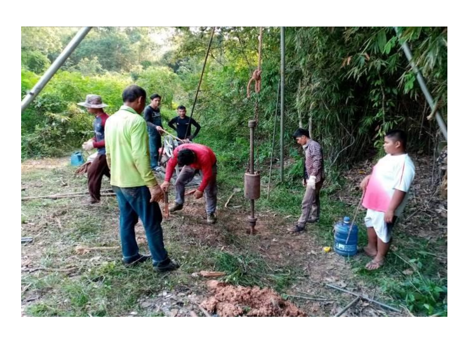
Output 1: Urban environmental infrastructure improved