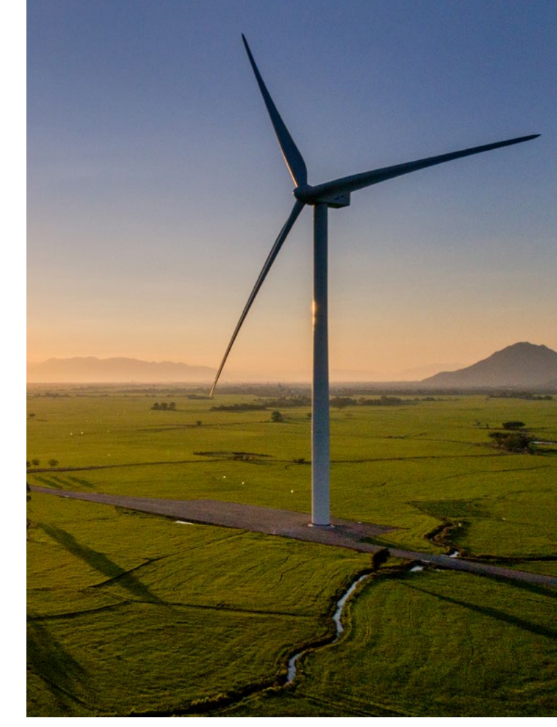
▲ Wind energy. In Viet Nam as elsewhere in the GMS, wind energy capacity is rapidly expanding as it becomes more cost-efficient.

Awareness of these impacts and concern that the demand projections were too high informed the revision of PDP7. Among the major changes were new targets to increase the proportion of renewable energy in the plan. Box 2 shows the changes between the original PDP7 and the revised plan, which was approved in 2016. The new plan called for a major reduction in the coal-fired power generation and a sevenfold increase in the amount of renewable energy. It is expected that these changes will reduce greenhouse gas emissions by 100 million tons of CO_2 equivalent a year by 2030. In economic value terms, this represents a saving of about $1 billion a year, based on a price estimate of $10 a ton of CO_2 .