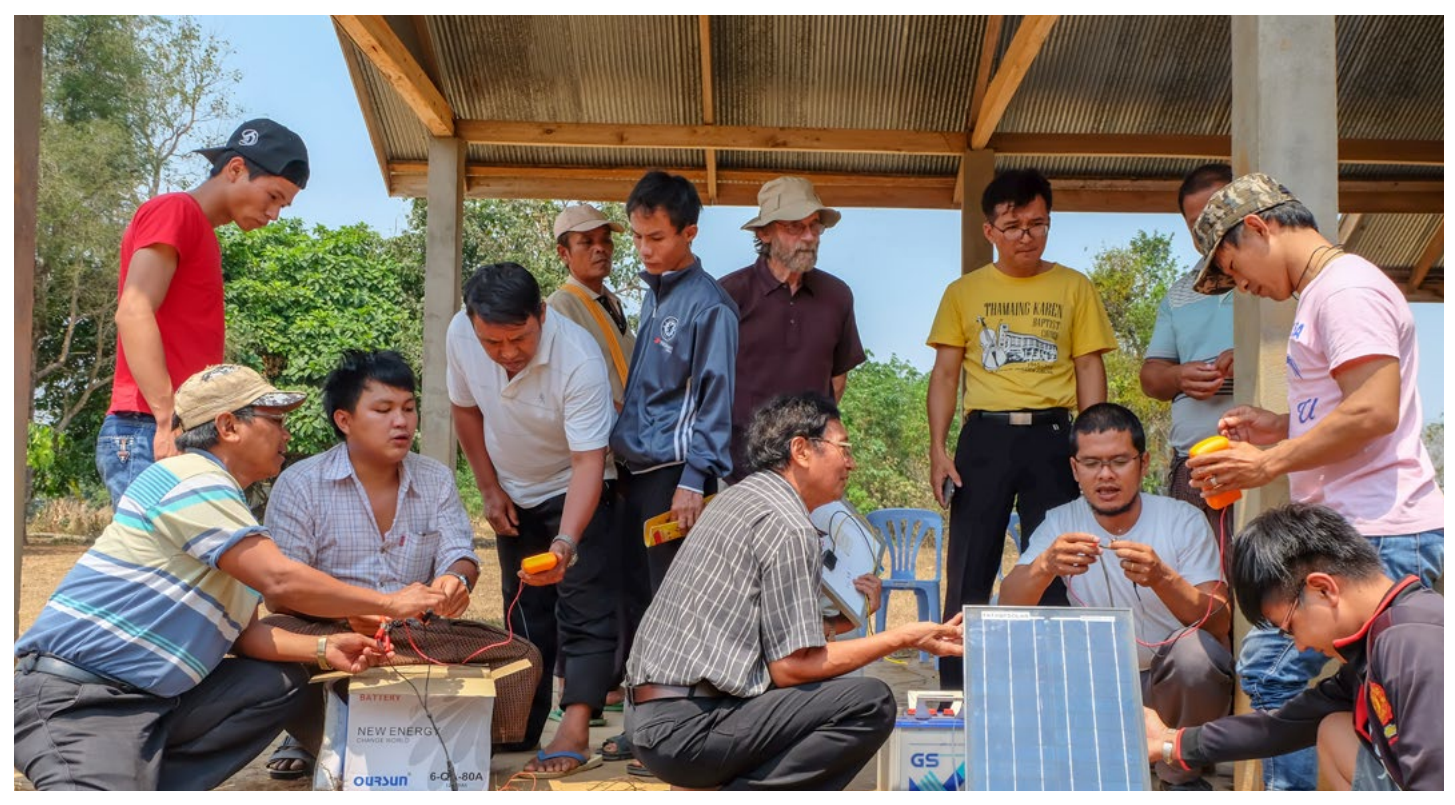
A Rural energy solutions. Access to electricity is still limited in rural Myanmar, but small-scale solar solutions can help overcome this challenge.