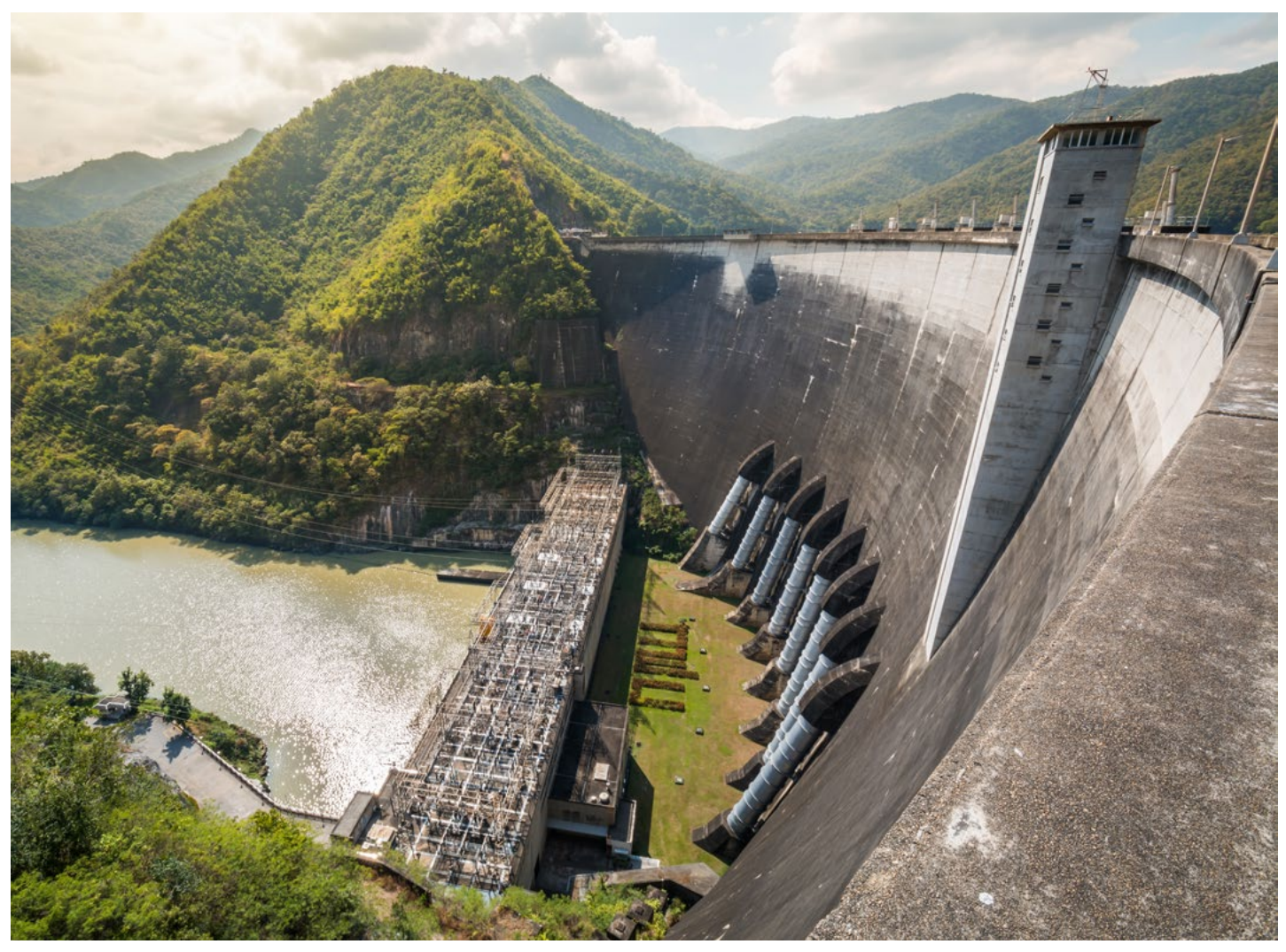
▲ Hydropower growing. The GMS countries are scaling up hydropower as a key renewable energy source, but need to carefully manage the environmental and social impacts.