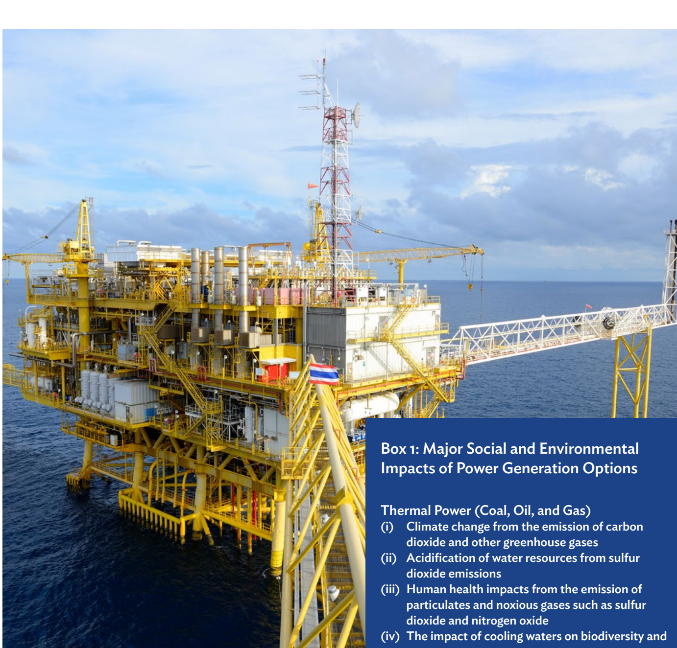
▲ Diversifying energy. The GMS countries are looking to diversify their energy sources to reduce their reliance on fossil fuels.

Assessing social and environmental impacts is at the heart of all SEAs. A high-quality SEA will not just identify these impacts, but quantify and, as far as possible, calculate an economic value for them. The valuation enables planners to compare the significance of different impacts; for example, greenhouse gas emissions from coal compared with resettlement and forest loss from hydropower. And if the valuation also calculates economic values for the scenarios, the full economic cost to society of the different planning options will be known and can inform decision-making.