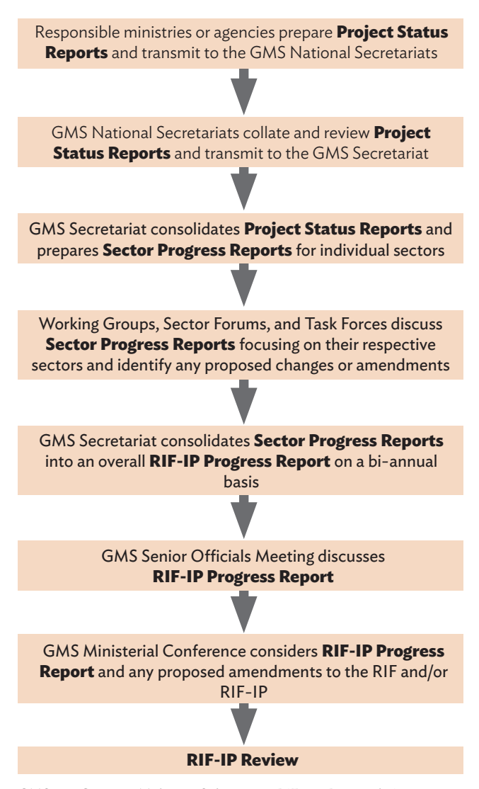
Figure 3: Proposed M&E Process

Figure 3 depicts the M&E process, starting with the preparation of Project Status Reports for individual RIF-IP projects by the responsible ministries or agencies, in cooperation with the GMS national secretariat and with the assistance of concerned ADB sector divisions as necessary.